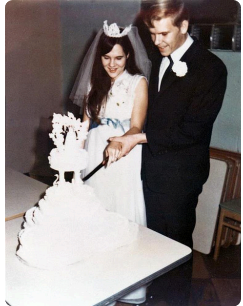
1970 Nov 21