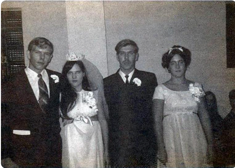
1970 Nov 21